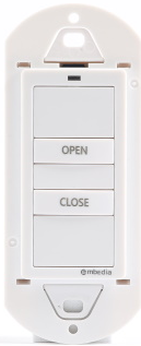
2-Button (Open/Close) Contact Closure (Dry Contact) Switch